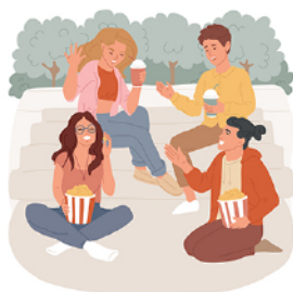
Go out with friends