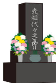
Visit ancestors' graves