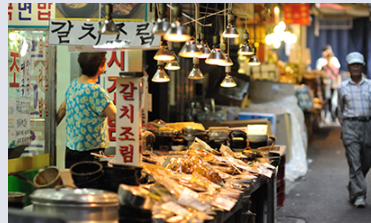
local food ローカルフード