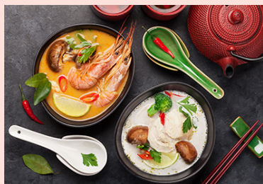
local cuisine 郷土料理