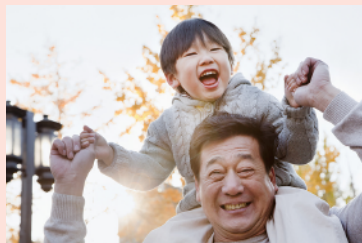
not expecting anything in return 見返りを何も求めない