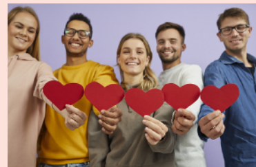
showing them unconditional love 無償の愛を示す

Would you share a story about how you showed someone love?