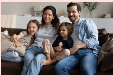
being by their side そばにいてあげる