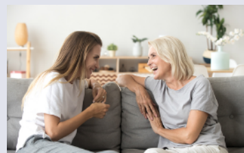
giving them tips

Tell me about a time when you showed love.