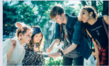
being kind to them