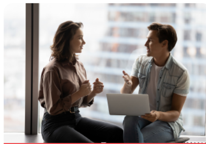
In my opinion