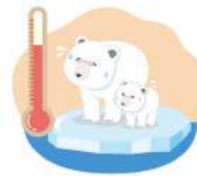
rising sea levels/ rising temperatures 海面上昇 / 気温上昇