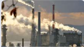
global warming 地球温暖化