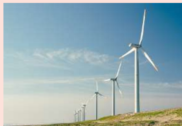
renewable energy 再生可能エネルギー