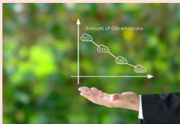
CO 2 emissions CO 2 排出量