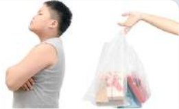
plastic bags ビニール袋