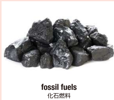
fossil fuels 化石燃料