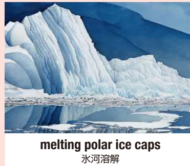
melting polar ice caps 氷河溶解