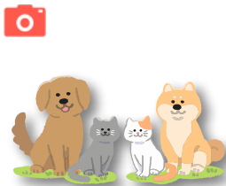
A taking photos of animals