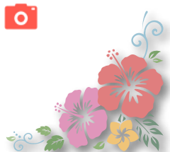
B taking photos of flowers