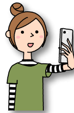
A taking a selfie