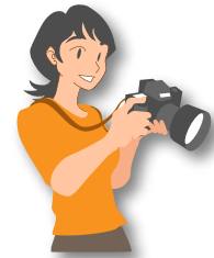
B film photography