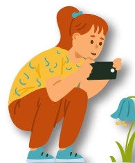
A smartphone photography