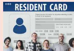
legal resident 合法的居住者

※ immigration (移民) - 国に入ってくる「移住・移民」を指す emigration (移住) - 出ていく意味での「移住・移民」を指す