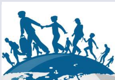
immigration 移民 (ある国から別の国に移り住むこと)