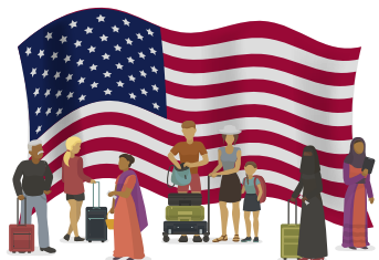
immigrant 移民・移民者 (他国から移り住んできた個人のこと)