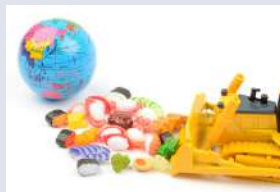
food loss 食品ロス