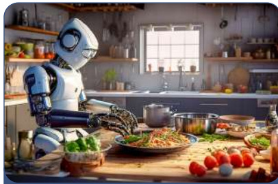
robots in households