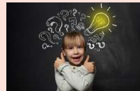
That's genius. (天才的に) 素晴らしい