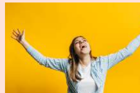
That's out of this world. (この世のものとは思えないほど) すごい