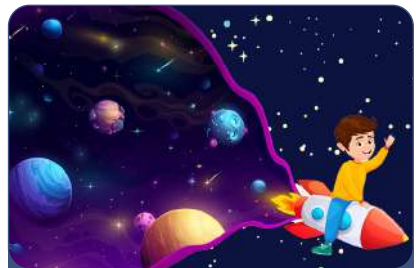
holidays in space