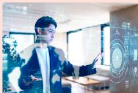
state of the art 最先端の