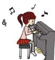
playing the piano