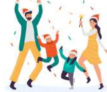
having a Christmas party