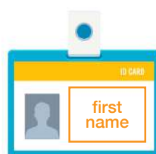
your first name