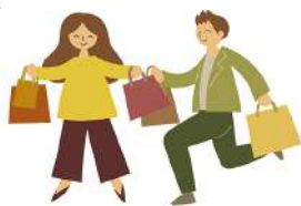
shopping for souvenirs