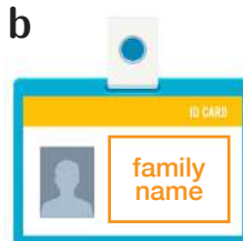
your family name