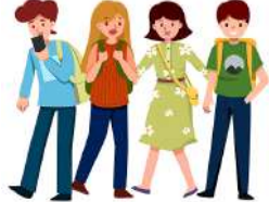
spending time with friends

Which do you prefer doing on Christmas day?