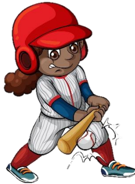
Jin loves baseball. She's good at _____.