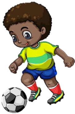
Shun likes soccer. He can _____.