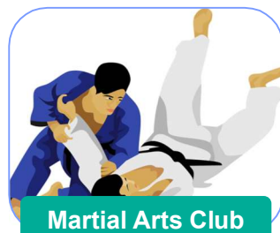
Martial Arts Club